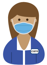
Nursing & Care Homes