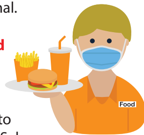
Restaurants & Bars